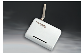
eNEXHO NT - internet module