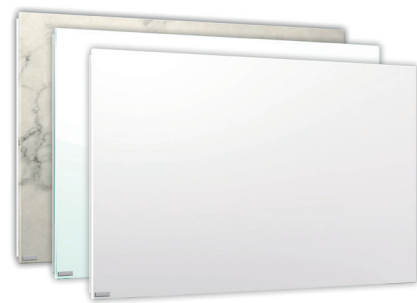
LAVA® CERAMIC | GLAS 2.0 | BASIC 2.0

eNEXHO is a complete product family that enables home automation with more comfort and security for homes, apartments and hotels. For the networking is a commercially available Wi-Fi router sufficient. If you connect this router to the Internet, access from outside to all components is easy and in real-time bi-directional possible.